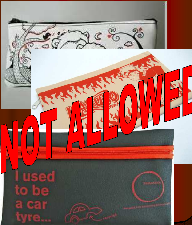
Non-transparent pencil cases